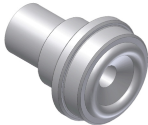
CV-01— Face Seal Gland Check Valve

CV-01 is a Check Valve contained within a standard 0.60" 1/4" Face Seal Gland with 1/4" tube stub.